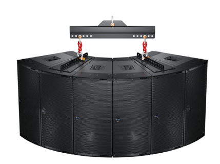
JM-1P horizontal array (six units) with two MPA-JM1 pickup plates suspended from a single point using the MTGSB-4B spreader bar

Constructed of premium birch plywood, the durable JM-1P enclosure is coated with a black-textured, hard-shell finish. A hex-stamped, steel grille with acoustical black mesh protects the unit's drivers. Other options include weather protection and custom color finishes for fixed installations and applications with specific cosmetic requirements. The optional MDB-JM1 dolly board transports the JM-1P safely and securely; multiple dolly boards can be interlocked to transport up to three linked JM-1Ps.